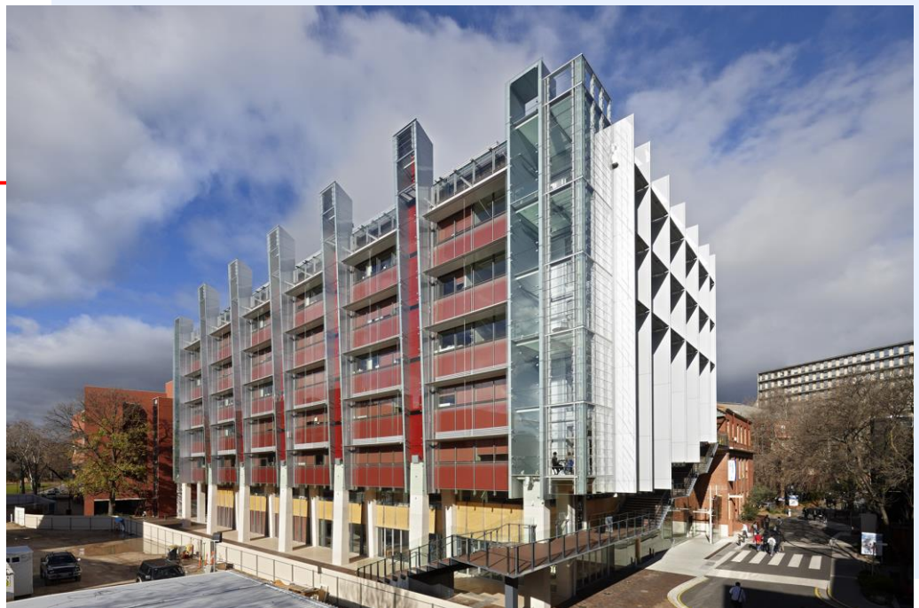
Ingkarni Wardli building, North Terrace Campus